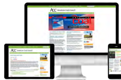
ACC's Association Website