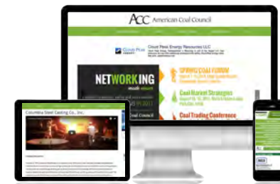
ACC's Buyers' Guide Platform