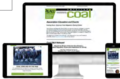
ACC's E-Newsletter Media

ACC distributes 18 electronic newsletters to more than 55,000 inboxes annually. Each newsletter drives traffic to ACC's website, content portal and buyers' guide, in addition to organic traffic from google search!